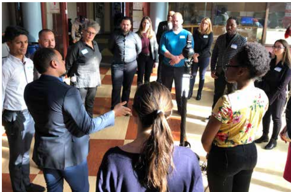
LGBTQ+ Panelists Being Recorded