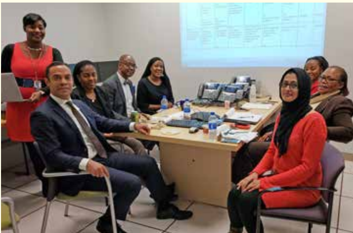
AESSC Assessment Committee at work