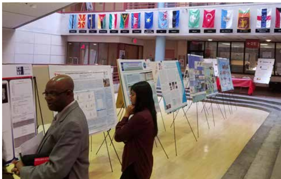
Research presentations in the Atrium

Zlabinger says all “instruments and abilities” are welcome and they often