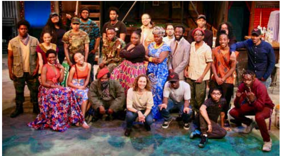
Cast and Director of Ruined