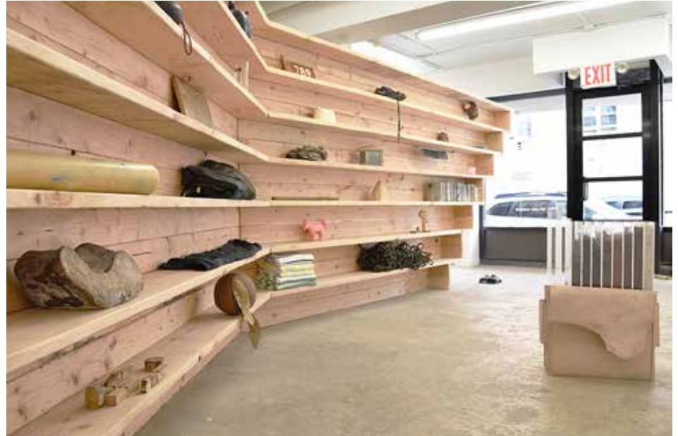
From from at the Cindy Rucker Gallery