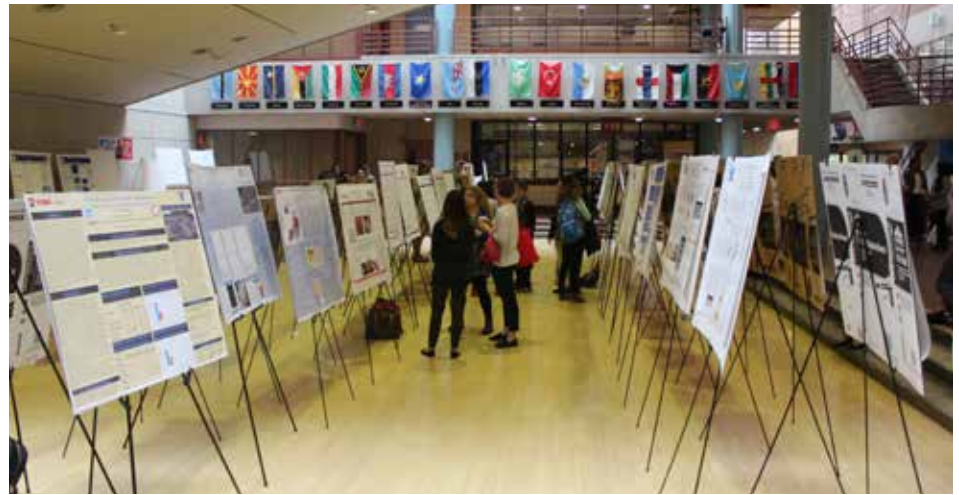
Student research posters displayed in the Artium

“Sleep is not going to solve all your problems,” Mednick explained, “but it will enhance perceptual skills, memory, and motor skills, such as riding a bike, performing surgery or gymnastics. Naps also enhance verbal memory.”