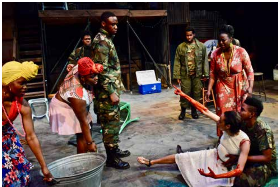
Cast on the set of Ruined

"She did an outstanding job of balancing the pathos, humor and danger of the play," he said, noting that the production was a challenging one. "Besides a large cast, the play calls for a complicated interplay between intricate theatrical elements—stage combat, dance, singing,