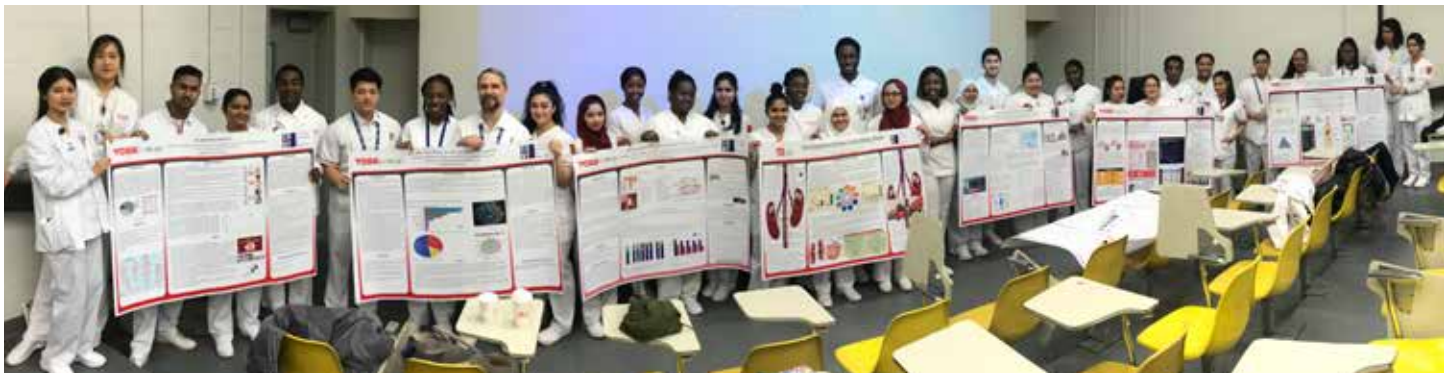
Nursing students with their research posters