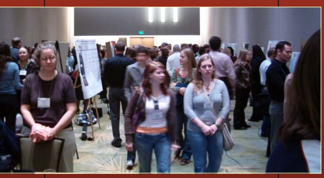
Student poster session at NCHC conference in Denver

"The administrative portion of the conference was