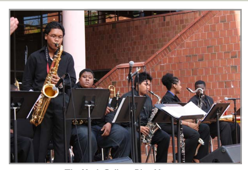
The York College Blue Notes

The college-wide due date for all other first reappointment portfolios is January 17.