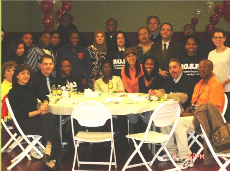
Students and faculty at the inaugural meeting of the Professional Organization of Students for Health (POSH)