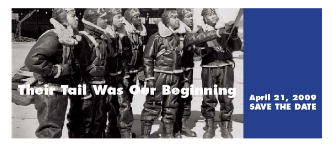
Academic Affairs Update, Vol. III, Issue 2, March 2009