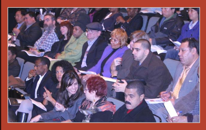
Faculty members following the Convocation proceedings

The Convocation program guide featured the mission phrase, "Recruit, Retain, Release/Respect," which was especially relevant given the College's mandate to recruit the best and brightest students, retain them by making York a desirable place on all levels, and graduating them within four to six years, all while showing the utmost respect for their needs and rights, and the needs and rights of faculty and staff who serve them.