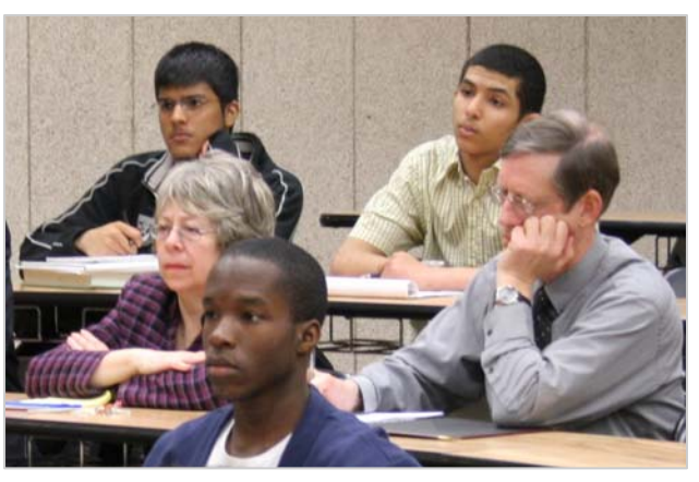
Students, faculty and administrators following the lecture.