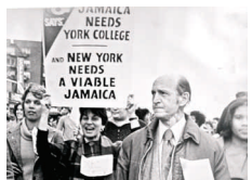
The community in support of York College

“The decision to place York College in Jamaica was the most critical factor in making York what it is today.”