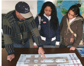
Students in ground school learning about runway and taxiway orientation