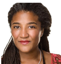
2009 Winner of the Pulitzer Prize for Drama, Lynn Nottage visited York in October

The Department of Fine and Performing Arts presented the play Fabulation , and the playwright, Lynn Nottage was invited to see York's interpretations of her play. The Pulitzer Prize-winning writer enjoyed the show and true to form, spent time on stage fielding questions from the audience of students, faculty, staff and guests.