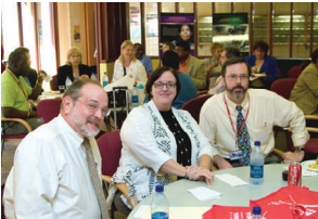
Faculty and administrators enjoyed the opportunity to mingle and reflect during the recent conference “Reorganization, Innovation, Excellence”

These are just a few of the new pedagogical approaches biology faculty are trying to improve student learning.