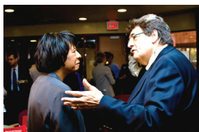
York faculty members found the conference an engaging experience