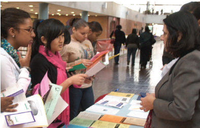
At York's recent Study Abroad Fair, students had many opportunities to ask questions about study abroad experiences.