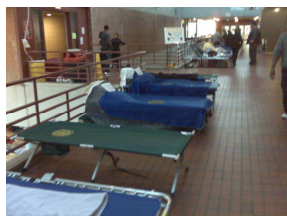
Temporary bedding in the Academic Core Building

“They treated them like they were their own [grand-parents], even better than they are being treated in the nursing home.”