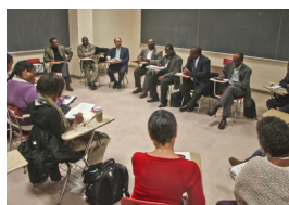
One of the many well-attended panels