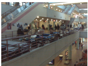
Almost 1,000 evacuees were sheltered by the college

“They treated them like they were their own [grand-parents], even better than they are being treated in the nursing home.”