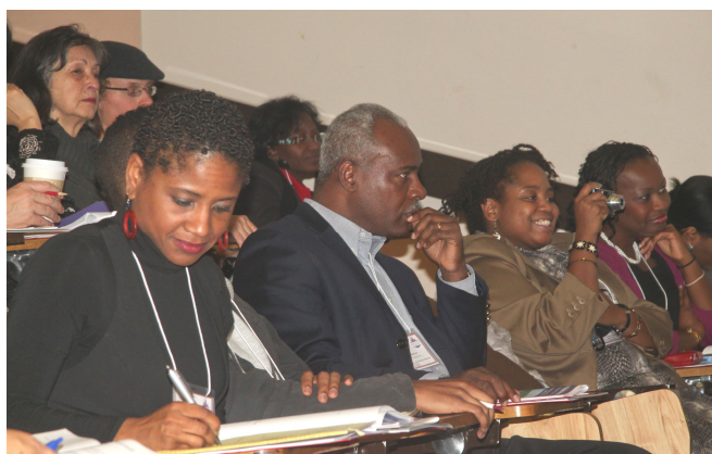
Attentive and engaged listeners attended the Haitian Studies Association conference

After a year of planning, the Haitian Studies Association’s (HSA) 24th Annual Conference unfolded to great approval in early November.