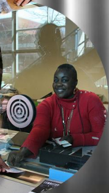
build an audience