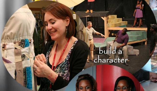
build a character