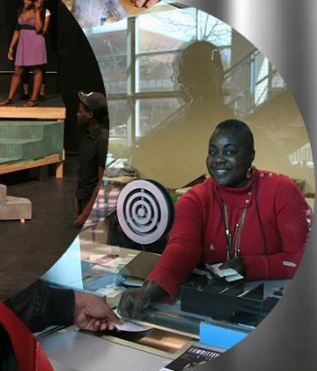
build an audience