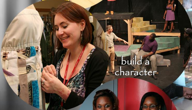
build a character