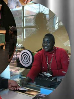
build an audience