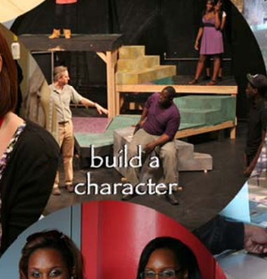
build a character